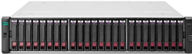
HPE MSA 2042 Storage (SFF)