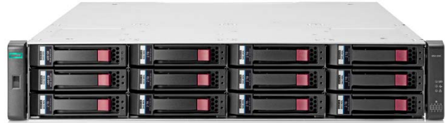
HPE MSA 2042 Storage (LFF)

The MSA 2042 further drives the MSA 2040 family into the world of flash acceleration with a new set of MSA models which includes 800GB of flash capacity in all SFF and LFF configurations. In addition to including 2x400GB Mixed Use SSDs in the base configuration, the MSA 2042 also includes a rich set of software features as standard including 512 Snapshots, Remote Replication and Performance Tiering capabilities, all at a very attractive price compared to other hybrid configurations. The 800GB of SSD capacity can be used as Read Cache or as a start to building a fully tiered configuration. With the inclusion of the Advanced Data Services SW License, customers can choose how to best utilize these SSDs to provide the optimal flash acceleration for their performance hungry applications. Both Read Cache and Performance Tiering utilize a real-time tiering algorithm which works without user intervention to place the most accessed data on the fastest medium at the right time. The MSA 2042 will dynamically move hot pages up to SSD for flash acceleration and move cooler, more stagnant data back down to spinning media as workloads change in real time hour-to-hour, day-to-day, and week-to-week. All done hands free and without any management overhead from the IT manager.