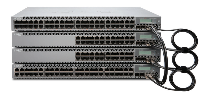
Figure 1: EX3300 Virtual Chassis connections

The EX3300 implements the same slot/module/port numbering schema as other Juniper Networks chassis-based products when numbering Virtual Chassis ports, providing true chassis-like operations. By using a consistent operating system and a single configuration file, all switches in a Virtual Chassis configuration are treated as a single device, simplifying overall system maintenance and management.