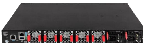
S9850-32H-G rear panel