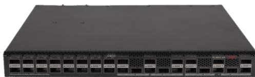
S9850-32H-G front panel