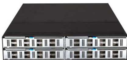
S9850-4C front panel