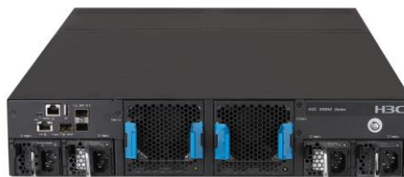
S9850-4C rear panel