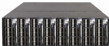
S9820-8C front panel