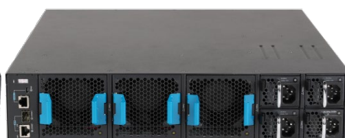
S9820-64H rear panel