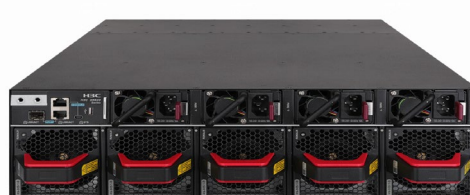
S9820-8C rear panel