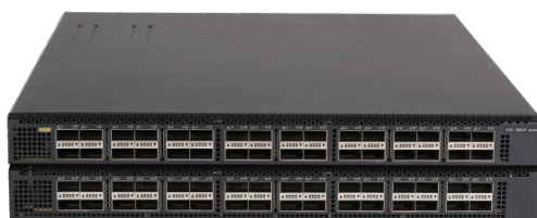
S9820-64H front panel