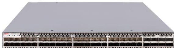
LS-S6850-56H-H3 front panel