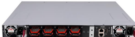
LS-S6850-56H-H3 rear panel