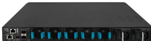
LS- S6850-56HF rear panel