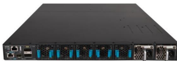
S6850-2C rear panel