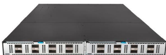
S6850-2C front panel