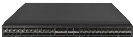
LS-S6850-56HF front panel