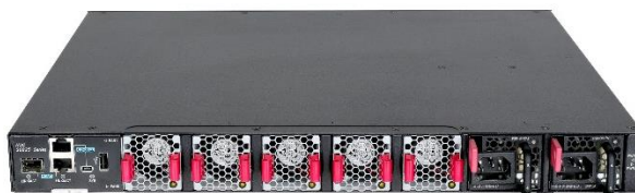
S6825-54HF rear panel