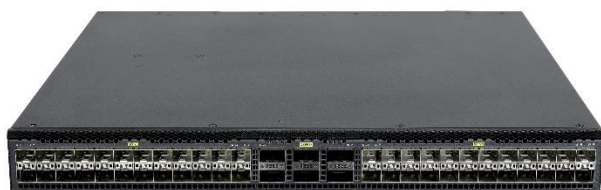
S6825-54HF front panel