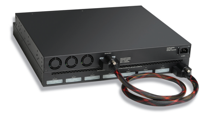
Figure 4: Rear view of the Brocade ICX-EPS 4000 connectivity.

capabilities that help organizations reduce administrative time and effort while securing their networks.