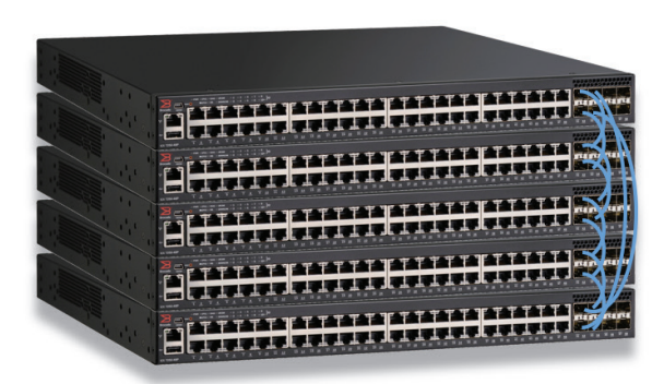
Figure 2 : Up to 12 Brocade ICX 7250 Switches can be stacked together using up to four full-duplex SFP+ 10 Gbps ports for a fully redundant backplane with 80 Gbps of stacking bandwidth.

at a fraction of the cost. The Distributed Chassis design future-proofs campus networks by allowing networks to easily and cost-effectively expand in scale and capabilities.