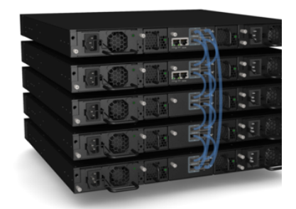
Figure 1 : Brocade ICX 6610 Switches can be stacked using four standard 40 Gbps QSFP ports that provide a fully redundant virtual chassis backplane with 320 Gbps of stacking bandwidth.

With capabilities such as bandwidth on demand, the Brocade ICX 6610 enables organizations to grow their networks when necessary. Organizations can initially deploy 1 GbE uplink ports and upgrade to 10 GbE ports when desired with an easyto-activate software license.