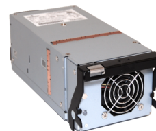
Arista 7500 Series Power Supply