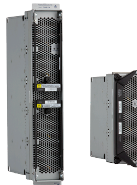
Arista 7500 Series Fabric Modules