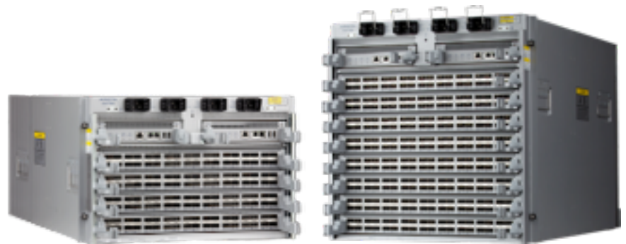
Arista 7500E Series Modular Data Center Switches

With front-to-rear airflow, redundant and hot swappable supervisor, power, fabric and cooling modules the system is purpose built for data centers. The 7500E Series is energy efficient with typical power consumption of under 4 watts per port for a fully loaded chassis. All of these attributes make the Arista 7500E an ideal platform for building reliable, low latency, resilient and highly scalable data center networks.