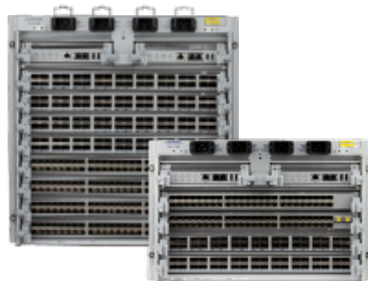
Arista 7500 Series Chassis

The 7500E series switches are equipped with four 2900W AC power supplies. The power supplies are 2+2 grid redundant and hot-swappable. The power supplies are gold climate saver rated and have an efficiency of over 90% with single stage conversion to the internal 12V DC voltage.