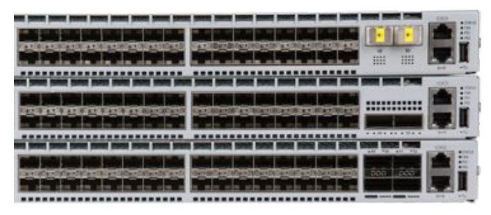
Arista 7280E Flexible Port Combinations

7280SE-64: 4 QSFP+ ports for 4x 40G or 16x10G