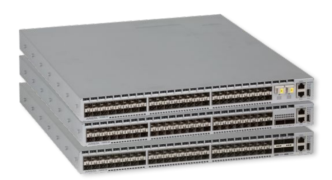
Arista 7280E family

All models in the 7280E Series deliver rich layer 2 and layer 3 features with wire speed performance up to 1.44 Terabits per second. The Arista 7280E Series offer a virtual output queue architecture combined with an ultra-deep 9GB of packet buffers that eliminates head of line blocking and allows for lossless forwarding under sustained congestion and the most demanding application loads. Combined with Arista EOS the 7280E Series delivers advanced features for HPC, big data, content delivery, cloud and virtualized environments.