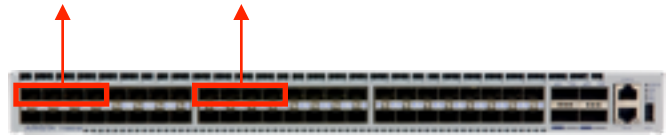
Arista 7150S AgilePorts - Four SFP+ grouped to deliver 40GbE