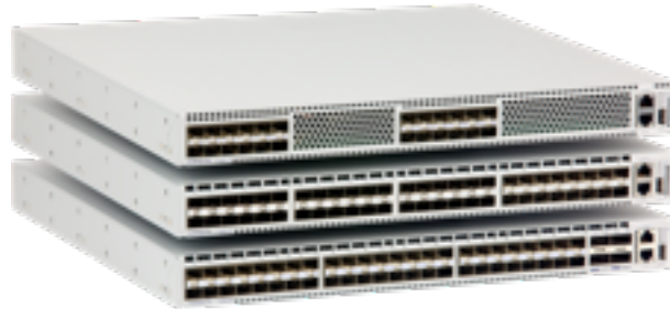
Arista 7150S family

Designed to suit the requirements of demanding environments such as ultra low latency financial ECNs, HPC clusters and cloud data centers, the class-leading deterministic latency from 350ns is coupled with a set of advanced tools for monitoring and controlling mission critical environments.