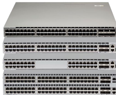
Arista 7050TX Series of 1/10GbE and 10/40GbE Switches Top to bottom: 7050TX-72Q, 7050TX-64, 7050TX-48, 7050TX2-128

All models in the 7050TX Series delivers rich layer 2 and layer 3 features with wire speed performance up to a maximum performance of 2.56Tbps. The Arista 7050TX switches offer low latency and a shared packet buffer pool of up to 16MB that is allocated dynamically to ports that are congested. With typical power consumption of less than 5 watts per 10GbE port the 7050TX Series are power efficient. An optional built-in SSD supports advanced logging, data capture and other services directly on the switch. Combined with Arista EOS the 7050X Series delivers advanced features for big data, cloud, virtualized and traditional data center designs.