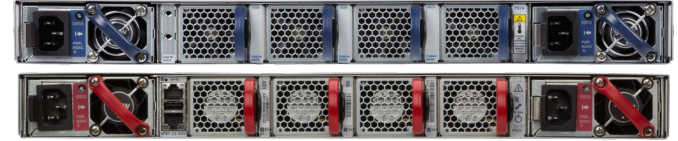
Arista 7050X 1RU Rear View: Rear-to-front airflow model (blue) Front-to-rear airflow (red)