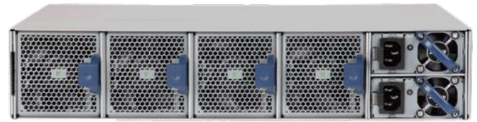
Arista 7050X 2RU Rear View: Rear-to-front airflow model (blue)