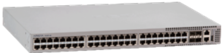
Arista 7010T-48: 48 port 10/100/1000 and 4 port 10GbE Switch

Consuming under 52W the 7010T are extremely power efficient at less than 1W per port. Built in power redundancy and customer reversible redundant fans allows cooling airflow in either forward or reverse direction in a single system.