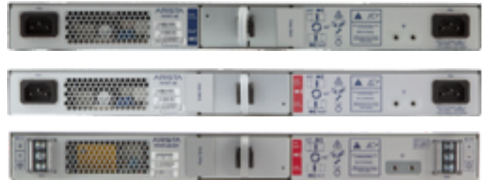
Arista 7010T Rear View - reversible airflow, AC & DC